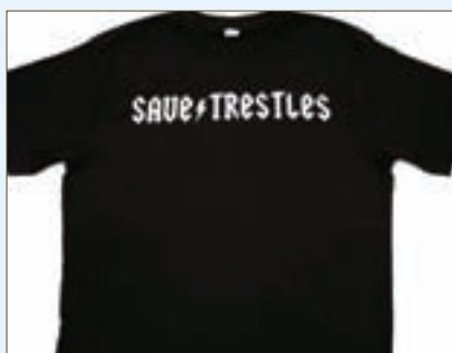
SAVE TRESTLES S/S organic cotton t-shirt (men's only) S-XXL $22